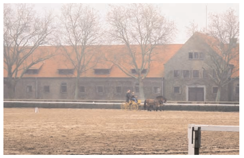
The enormous outdoor arena in the middle of Die Deutsche Reitschule