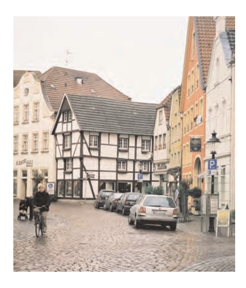
The old city of Warendorf is wonderfully charming with killer cobblestones, but great tack shops!

In another difference in riders, Europeans ride with very close legs, so Eckart and others encourage opening the knee slightly so the leg doesn't grip so much. I routinely see