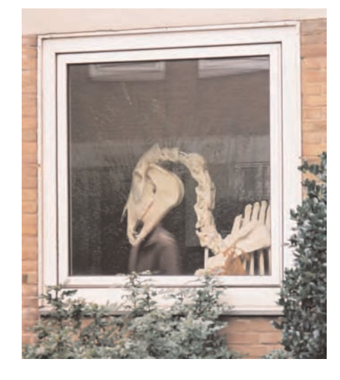
Only at Die Reitschule in Warendorf would you see such a window in a courtyard - a horse skeleton, posed in Grand Prix collection...